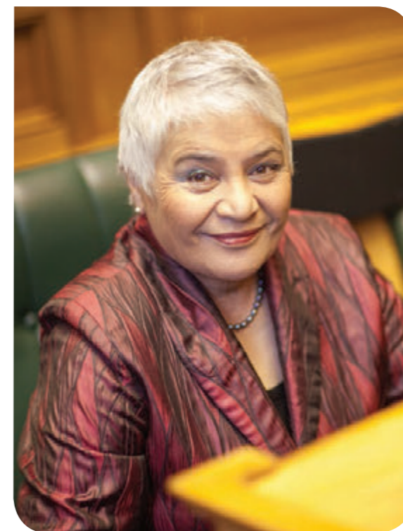
Hon. Dame Tariana Turia, (Ngāti Apa, ↑ Ngā Rauru, Whanganui iwi) Political leader, Smokefree champion

← Whina Cooper, 1895–1994 (Ngāti Kuri) Led the 1975 land march from Te Hāpua to Parliament