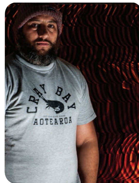
Israel Birch, (Ngapuhi, Ngāi Tawake, ↑ Ngāti Rākaipaaka, Ngāti Kahungunu) Visual artist

← Taken in 1898, this picture depicts women who wove mats for the meeting house Te Rauru. Te Rauru can now be found in Hamburg, Germany.